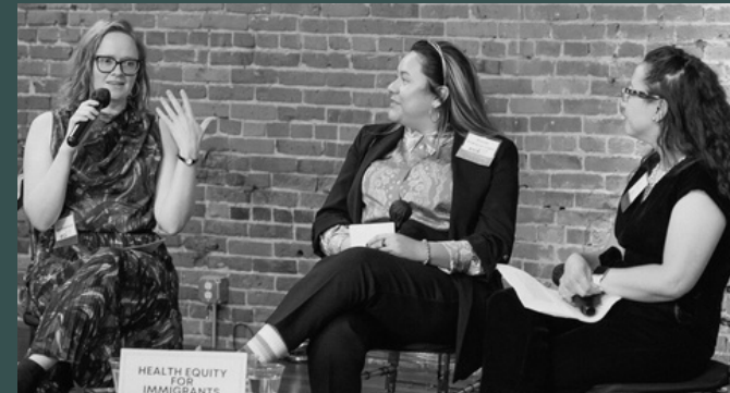
Health equity for immigrants panel conversation, EOI Changemakers Remixed 2022

EOI successfully advocated for several policies aimed to control consumer costs, improve access to health care, and protect health care workers, including: