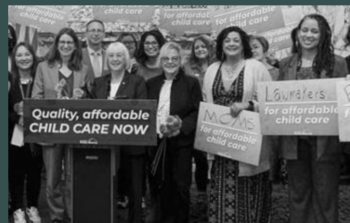
State and federal lawmakers and child care advocates in Olympia, WA

EOI and childcare advocates helped secure and bolster funding for crucial programs through appropriations in Washington's supplemental budget, including: $125.7 million to increase the state's subsidy rate for kids from low-income families and support childcare centers and family providers; $14.6 million to expand Early Childhood Education and Assistance Program, the state's early learning program for children from low-income families; and $1.3 million to waive background check fees and convene a background check workgroup to help ease difficulties in hiring new staff.